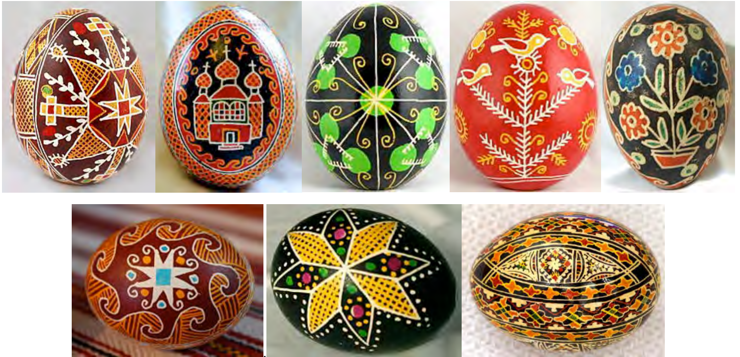
Excerpt from wikipedia

There are many types of decorated eggs produced in Slavic culture, and their names are usually based on the techniques used to prepare them. Shown here are Pysanky eggs from Ukraine and Poland. The decoration process uses the wax batik method. The process of dyeing has to be organized from the lightest to the darkest colors of the dyes. The wax protects the parts of the eggshells underneath it from being dyed, and when it's melted the patterns are revealed.