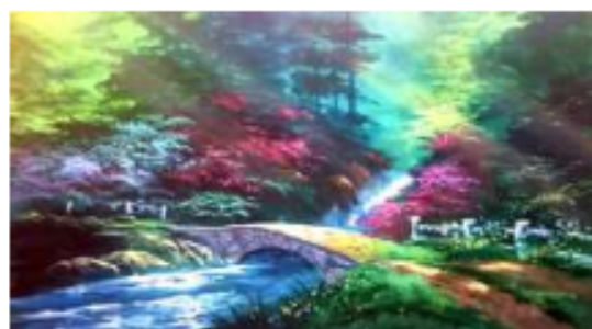
Pathway to Eden- Sat. Nov 11,2023 11x14 inch canvas

November 11 and 12, 2023 (9 am- 4 pm PST)