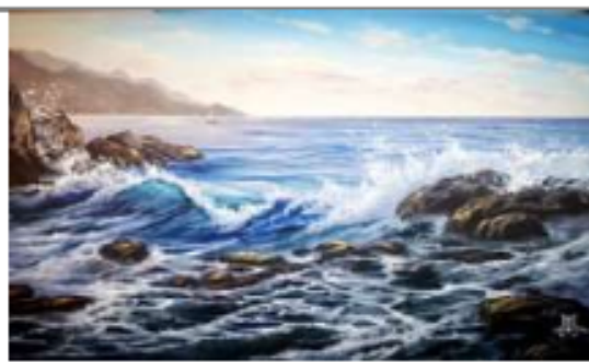
Tidal Forte- Sunday Nov 12, 2023 11x14 inch canvas